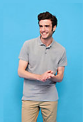
SOL'S SPRING II 11362