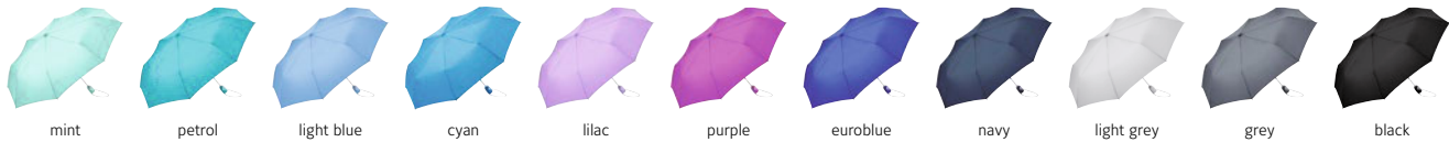
mint petrol light blue cyan lilac purple euroblue navy light grey grey black