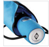
Soft-Touch handle with silver push-button and promotional labelling option