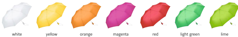
white yellow orange magenta red light green lime

Convenient automatic open/close function for quick opening and closing, high-quality windproof system for maximum frame flexibility in stormy conditions, chromed steel shaft, Soft-Touch handle in colour matching cover with silver push-button, elastic loop and promotional labelling option, sleeve with black piping. Also available as another mini umbrella (art. 5565), as regular umbrella (art. 7560) and golf umbrella (art. 7580).