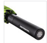
Two promotional labelling options