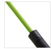
Steel frame with coloured coated shaft