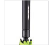
Exclusive soft handle with push-button