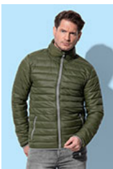
ST5200 Padded Jacket